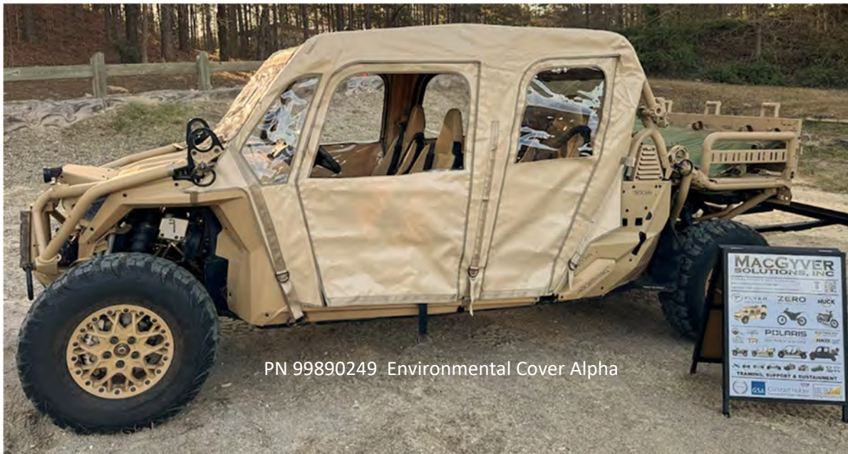
PN 99890249 Environmental Cover Alpha

Polaris MRZR-Alpha / Ultra Light Tactical Vehicle -ULTV with Environmental Cover fully installed.